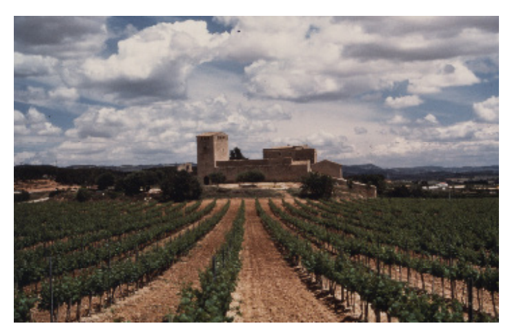
We will visit our 12th-century Castle of Milmanda and surrounding vineyards before lunch.