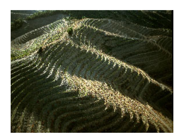
WE'LL VISIT OUR SPECTACULAR VINEYARD AND WINERY IN PRIORAT