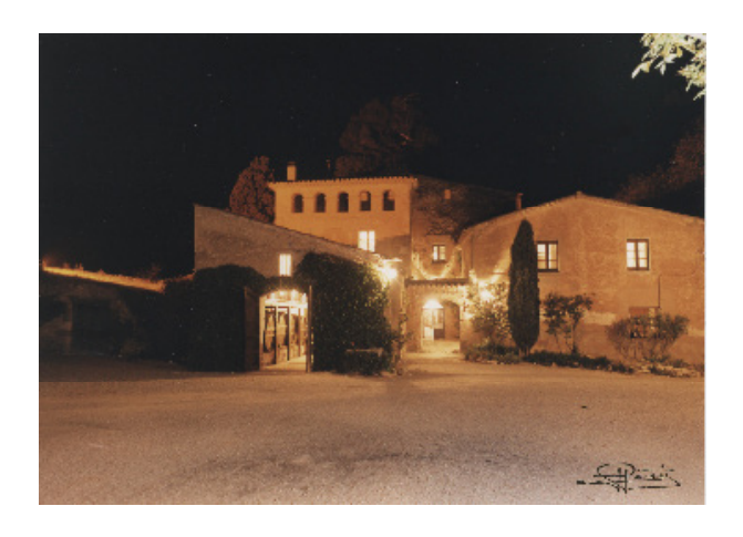
MAS RABELL ESTATE, A 14TH-CENTURY FARMHOUSE TURNED INTO THE TORRES FAMILY RESTAURANT